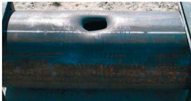
Fig. 1. Pipe rapture after experimental tests

The first stage of experimental work (pipe elements without any protective layer subjected to HE) have shown very low resistance of gas-pipe components to explosive-charge-effected loads.