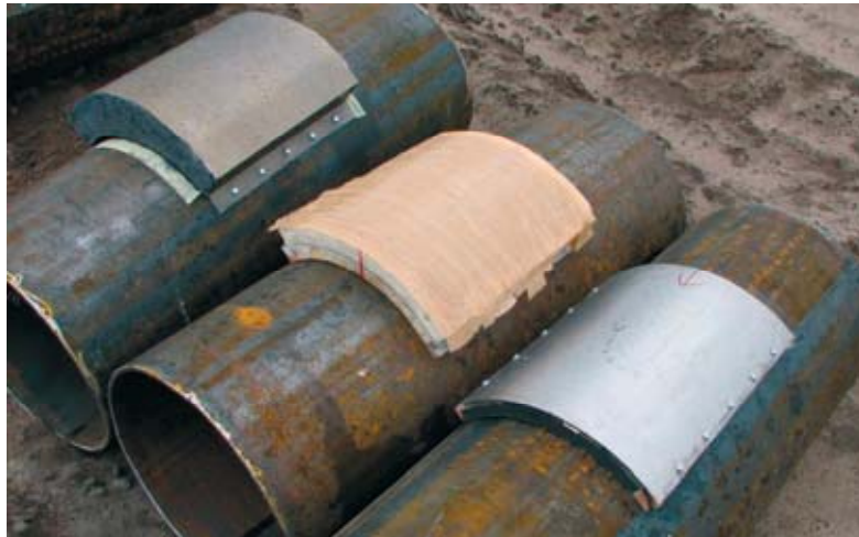
Fig. 3. Exemplary pipe specimen with attached protective panels used in field tests

The tests resulted in finding how strains were changing with time. On the grounds of the analyses of findings on how the strains were changing one can determine the effectiveness of particular panels in absorbing the shock-wave energy. The lowest values of elastic strains were gained for the spatial structure panel (number 3). At the same time, no plastic strains were in practice recorded in the course of tests with the same structure panel employed. For the panel 1 and 2 the overall strains gained were contained within the range of 0.008-0.009, whereas the plastic strains-within the range of 0.004-0.009. What confirmed the reliability of the measurements taken with the strain-gauge method were permanent pipe deformations (Fig. 4).